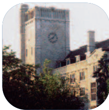
Administration and Management