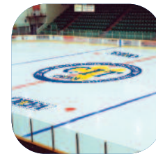
Refrigeration and Ice