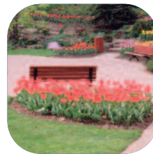
Buildings and Grounds