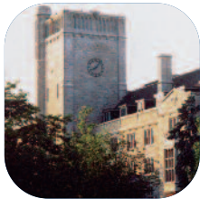
Administration and Management

ONTARIO RECREATION FACILITIES ASSOCIATION INC.