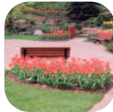
Buildings and Grounds