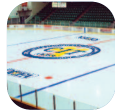
Refrigeration and Ice